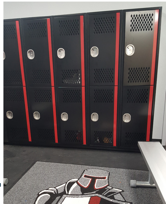
2 Tier with Custom Louvers